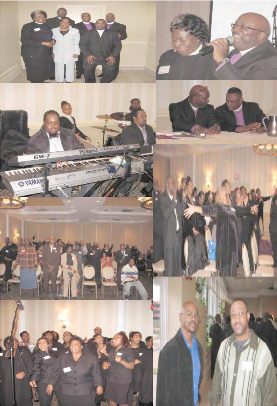
Worship and Praise went forth as Virginia celebrates it's first annual conference, held in Richmond, VA